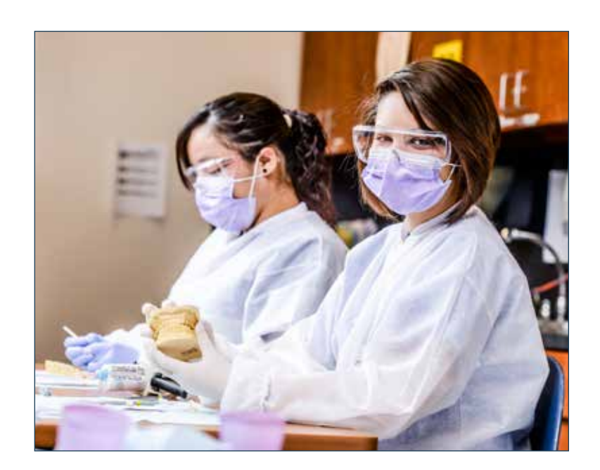
<sup>2</sup>Employment not guaranteed for students or graduates.

See campus for certification details. Cost of first attempt at certification exam included in tuition.<sup>4</sup>