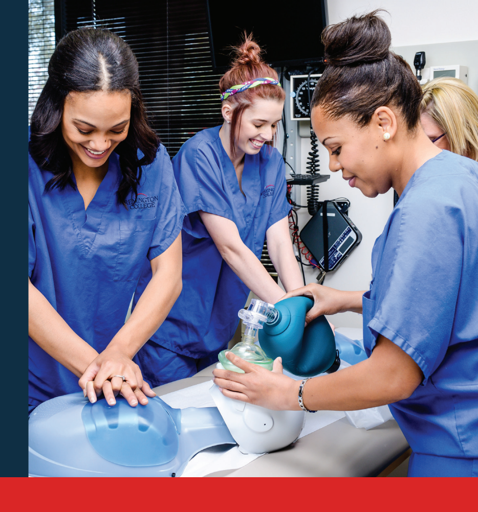
<sup>4</sup>Employment not guaranteed for students or graduates. <sup>5</sup>Certain restrictions may apply.